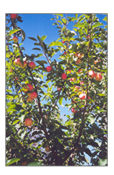
September Ruby Apple fruit

This is a deciduous tree with a more or less rounded form. Its average texture blends into the landscape, but can be balanced by one or two finer or coarser trees or shrubs for an effective composition. This is a high maintenance plant that will require regular care and upkeep, and is best pruned in late winter once the threat of extreme cold has passed. Gardeners should be aware of the following characteristic(s) that may warrant special consideration;