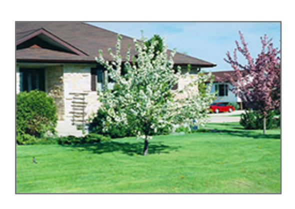
Norkent Apple in bloom

This tree is typically grown in a designated area of the yard because of its mature size and spread. It should only be grown in full sunlight. It prefers to grow in average to moist conditions, and shouldn't be allowed to dry out. It is not particular as to soil type or pH. It is highly tolerant of urban pollution and will even thrive in inner city environments. This particular variety is an interspecific hybrid.