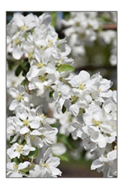
Norkent Apple flowers