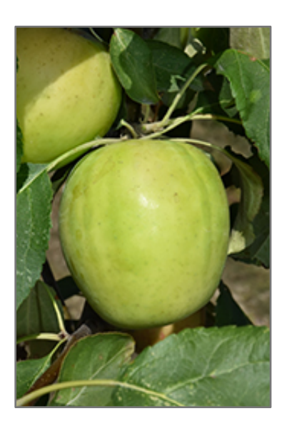
Norkent Apple fruit

Norkent Apple features showy clusters of lightly-scented white flowers with shell pink overtones along the branches in mid spring, which emerge from distinctive pink flower buds. It has forest green deciduous foliage. The pointy leaves turn yellow in fall. The fruits are showy light green apples with scarlet stripes, which are carried in abundance in late summer. The fruit can be messy if allowed to drop on the lawn or walkways, and may require occasional clean-up.