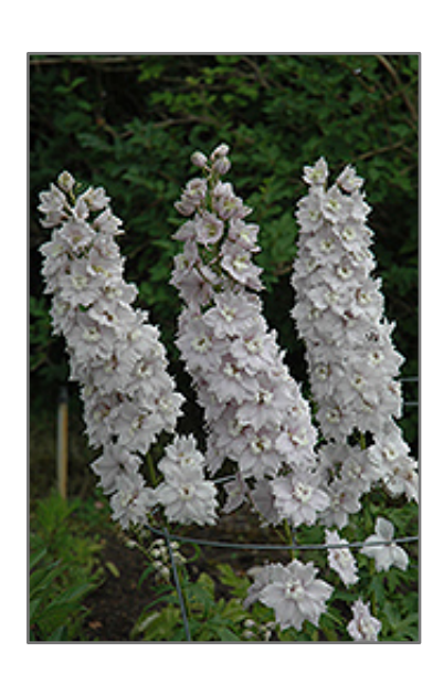
Double Innocence Larkspur flowers

A magnificent display of white double flowers on towering spikes with contrasting apple-green bee; good vertical form, dense flower spikes and strong stems; excellent uniformity