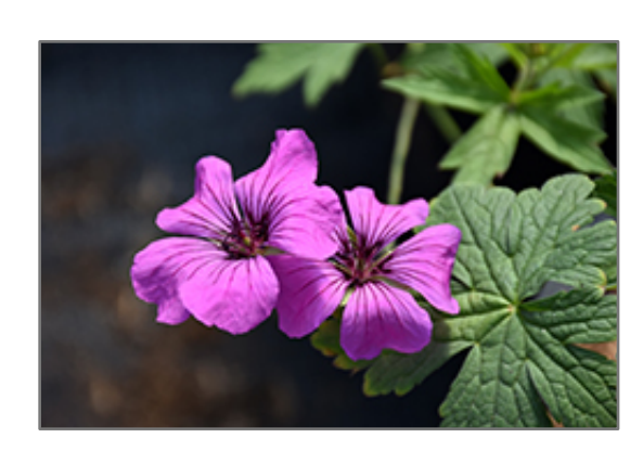
Patricia Cranesbill flowers

This variety presents a dense, low mat of dark green leaves with stunning hot pink flowers covering the stems in summer; great for a rock garden or edging