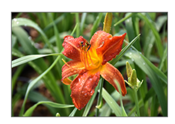
Anzac Daylily flowers

Bright, large scarlet blooms with lighter red midribs and chartreuse throat; sturdy, strong, easy to care for, great grassy texture and form; good for the beginner gardener and the pro