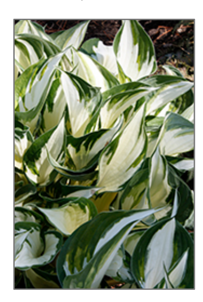
Fire and Ice Hosta foliage