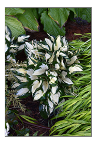
Fire and Ice Hosta

Fire and Ice Hosta is recommended for the following landscape applications;