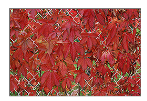
Englemann Ivy in fall

A popular, tough and hardy vine for screening, excellent along fences and arbors, up the sides of houses or climbing trees; features large five-lobed leaves that turn red and purple in fall, small black berries; self-clinging, extremely adaptable