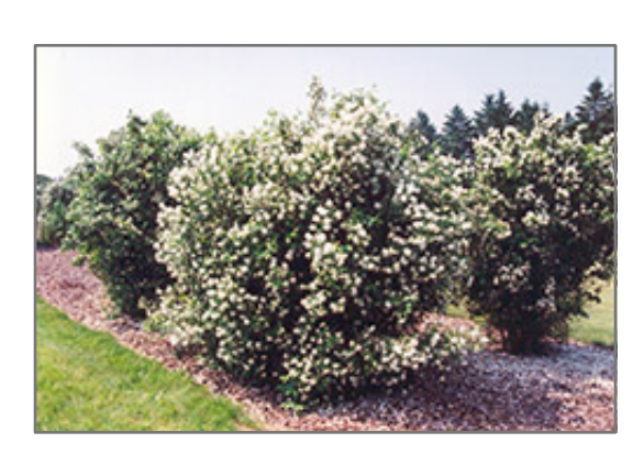
Lewis Mockorange in bloom

A large, sprawling shrub prized for its fragrant white blooms in early summer; wonderful in bloom, but fades into the background the rest of the year, best used in a composition with other plants; very adaptable and easy to grow