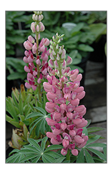
Gallery Pink Lupine flowers

A stunning dwarf hybrid producing thick spikes of eye catching two-tone pink and white flowers; a tremendous visual impact massed in the garden, border plantings or in containers