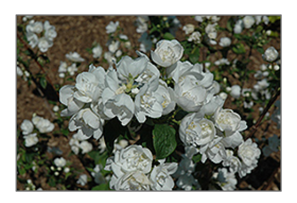
Snow White Sensation Mockorange flowers

A stunning flowering shrub covered in lovely citrus scented double white blooms in late spring; spectacular in flower, fades to the background the rest of the year, use in conjunction with other plants; very adaptable, good form for a mockorange