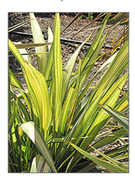
Yellow Wave New Zealand Flax