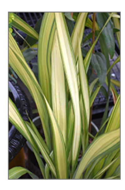
Yellow Wave New Zealand Flax foliage