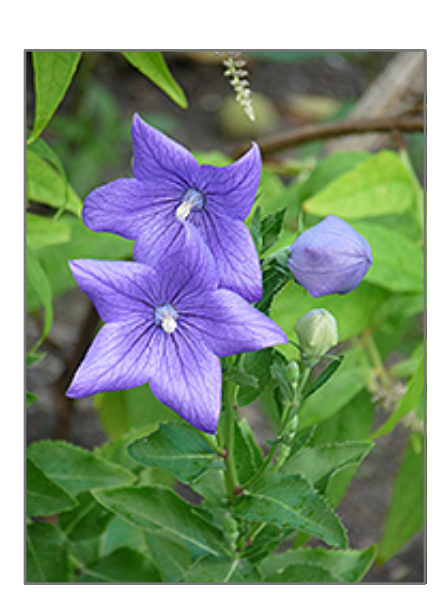
Balloon Flower flowers

A beautiful summer blooming perennial with large buds that resemble balloons that eventually open into saucer shaped stars; great for borders, rock gardens, and containers; a long lasting cut flower