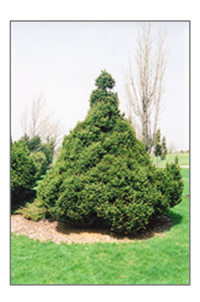
Ohlendorf Spruce

This popular garden shrub is very much like a miniature version of the species, forms a medium-sized conical to spire-shaped shrub; adaptable and hardy, great for adding some scaled-down dynamics to the garden skyline