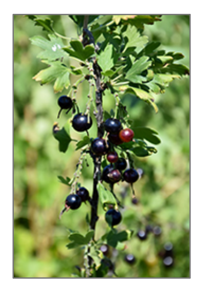
Black Currant fruit

Black Currant has rich green deciduous foliage on a plant with a round habit of growth. The lobed leaves turn yellow in fall. It features an abundance of magnificent black berries in mid summer.