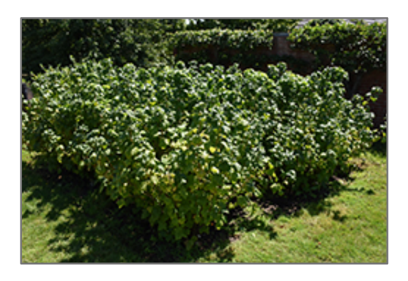
Black Currant