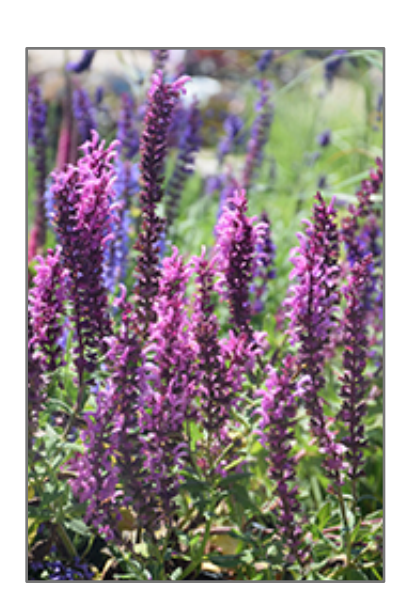
Pink Friesland Sage flowers

This compact variety features flowers of an unusual deep pink shade; deadhead to encourage repeat flowering; drought tolerant once established