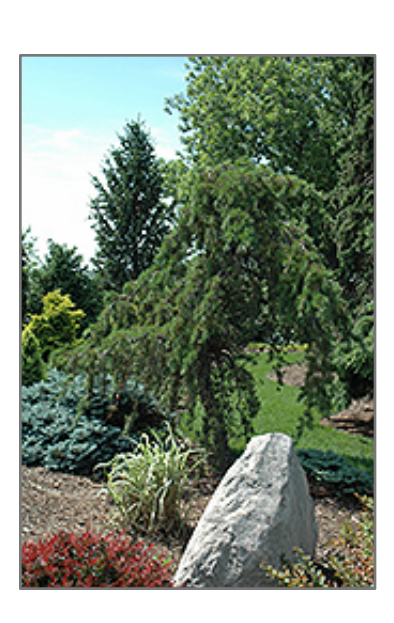
Uncle Fogy Jack Pine

Uncle Fogy Jack Pine is a dwarf conifer which is primarily valued in the landscape or garden for its highly ornamental weeping form. It has rich green evergreen foliage. The needles remain green throughout the winter.