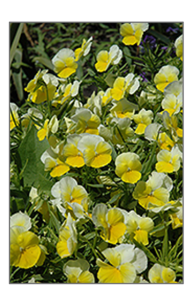
Panola Primrose Pansy flowers

Medium sized blooms in stunning yellow hold up well in milder winter months; needs sun or partial sun for best flowering; blooms profusely in spring and fall