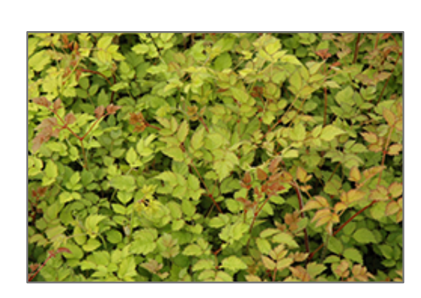
Color Flash Lime Astilbe foliage

Striking blush pink colored plumes rising above glossy leaves that start out bright yellow and turn chartreuse for the summer; perfect in a shady spot with dappled light; prefers moisture so water regularly for abundant flowers and nice foliage