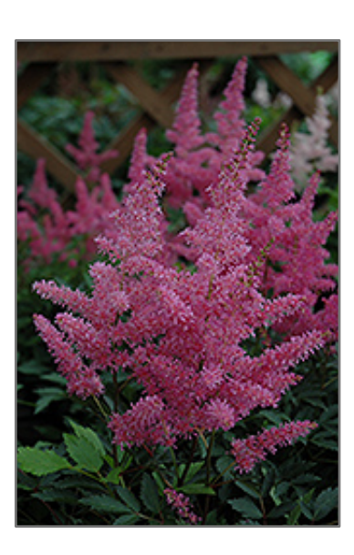
Younique Lilac Astilbe flowers

Incredible full plumes of lavender-pink on strong stems; best in a shady spot with dappled light; prefers moisture so water regularly for abundant flowers and nice foliage; perfect for mixed containers; plume heads can be left for winter interest