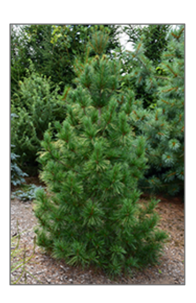
Columnar White Pine