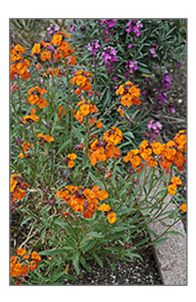
Apricot Twist Wallflower flowers

Fragrant orange-apricot blooms from lavender buds; a cool season bloomer, best performance in full sun; this is a self-seeding biennial but can be planted annually; may succumb to root-rot if winter soil is wet and not well-drained