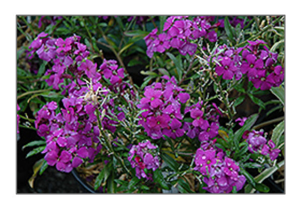
Poem Lilac Wallflower flowers

Beautiful lilac flowers, tantalizing aroma; evergreen in milder climates; a cool season bloomer, best performance in full sun; this is a self-seeding biennial but can be planted annually; may succumb to root-rot if winter soil is wet and not well-drained