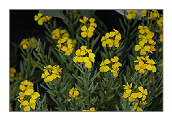
Precious Gold Wallflower flowers

Beautiful golden flowers, tantalizing aroma; evergreen in milder climates; a cool season bloomer, best performance in full sun; this is a self-seeding biennial but can be planted annually; may succumb to root-rot if winter soil is wet and not well-drained