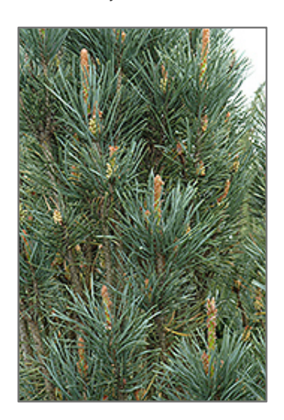
Scotch Sentinel Pine foliage