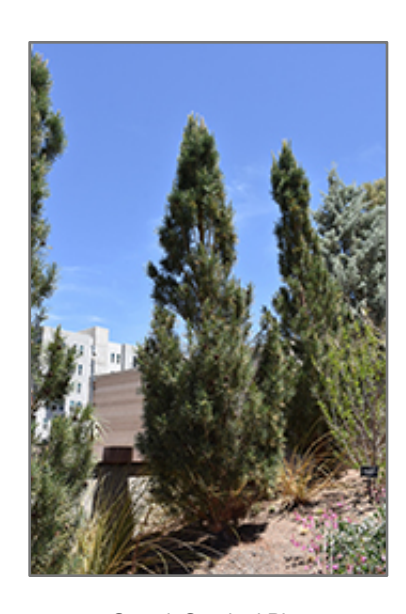
Scotch Sentinel Pine