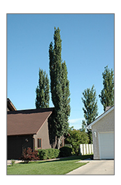
Columnar Swedish Aspen