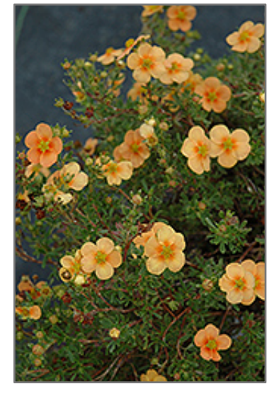
Orange Whisper Potentilla flowers

A naturally dense and mounded shrub with pretty orange flowers on and off from June until frost and fine textured bright green foliage; flower color is best in light afternoon shade, tough and adaptable, dislikes wet soils