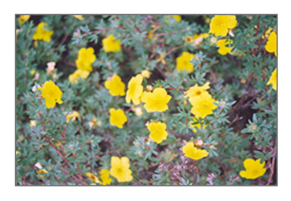
Yellow Gem Potentilla flowers

Yellow Gem Potentilla is a dense multi-stemmed deciduous shrub with a more or less rounded form. Its relatively fine texture sets it apart from other landscape plants with less refined foliage.