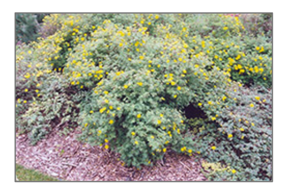
Yellow Gem Potentilla in bloom

This is a relatively low maintenance shrub, and is best pruned in late winter once the threat of extreme cold has passed. It is a good choice for attracting butterflies to your yard, but is not particularly attractive to deer who tend to leave it alone in favor of tastier treats. It has no significant negative characteristics.