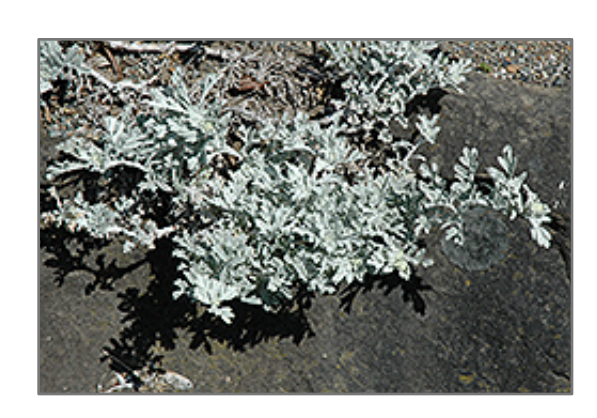
Dusty Miller

Beautiful lacy silver foliage is valued for its texture and contrast in the garden; this variety attracts wildlife and is resistant to deer; does best in poor, dry soils, an ideal groundcover for adverse conditions where little else will grow