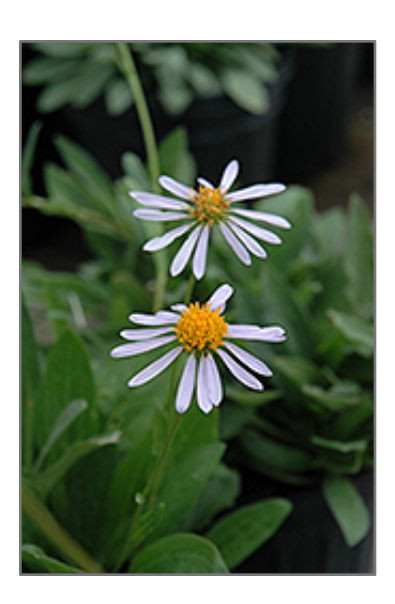
Wartburg Star Aster flowers

Profusion of lavender-blue flowers that mature to white, and attractive lance-like green leaves; prefers cool, moist soil; water the root zone instead of from the top to reduce fungal disease; water regularly to encourgage more blooms