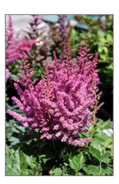
Little Vision In Pink Chinese Astilbe flowers

This dwarf variety produces showy light pink plumes, rising above deep green leaves; dense, upright form; perfect in a shady spot with dappled light; prefers moisture so water regularly for abundant flowers and nice foliage