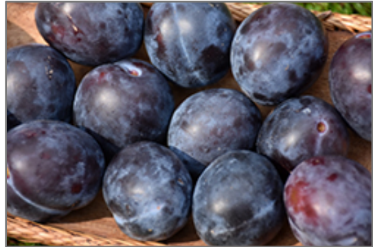
Mount Royal Plum fruit