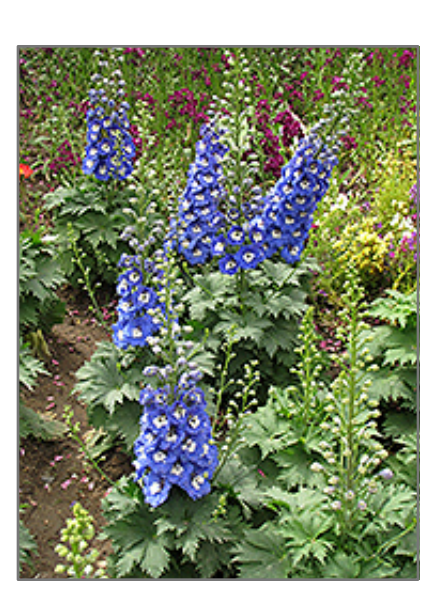
Magic Fountains Blue White Bee Larkspur in bloom