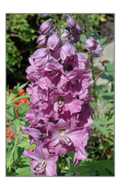
Sweethearts Larkspur flowers

An impressively tall display of lovely pink flowers on towering spikes with either a shell pink or white bee; good vertical form, dense flower spikes and strong stems; excellent uniformity