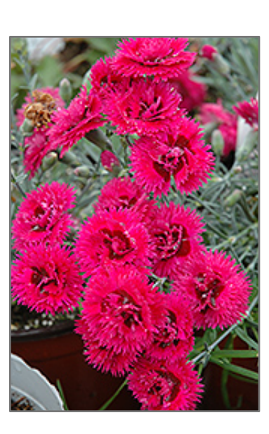
Double Star Starlette Pinks flowers

Pretty flowers are magenta with dark-red centre ring, covering mounds of fine foliage; great for flower arrangements; deadhead to rebloom; pair up with summer blooming perennials and annuals to time a continued flower display