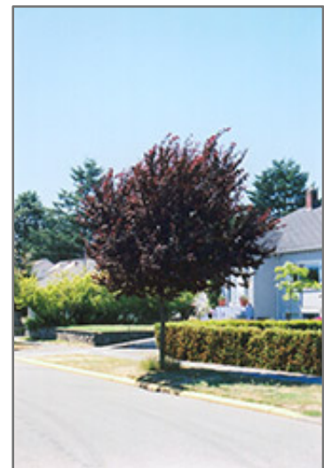
Newport Plum