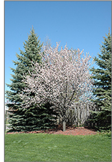
Newport Plum in bloom

This tree should only be grown in full sunlight. It does best in average to evenly moist conditions, but will not tolerate standing water. It is not particular as to soil type or pH. It is highly tolerant of urban pollution and will even thrive in inner city environments. This is a selected variety of a species not originally from North America.