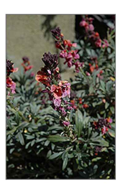
Julian Orchard Wallflower flowers

Emerging salmon flowers mature to purple with a tantalizing aroma; evergreen in milder climates; best performance in full sun; this is a self-seeding biennial but can be planted annually; may succumb to root-rot if winter soil is wet and not well-drained