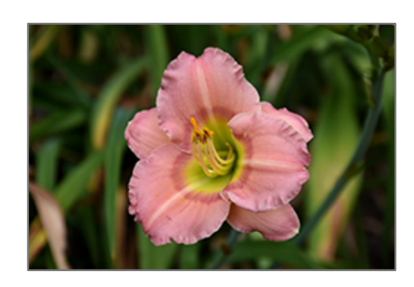
Chorus Line Daylily flowers

Pretty pink trumpets with a bright yellow throat and a rose-pink ring; provides an elegant compliment to other plants; sturdy, strong, easy to care for, great grassy texture and form; a stunning display when massed in the garden