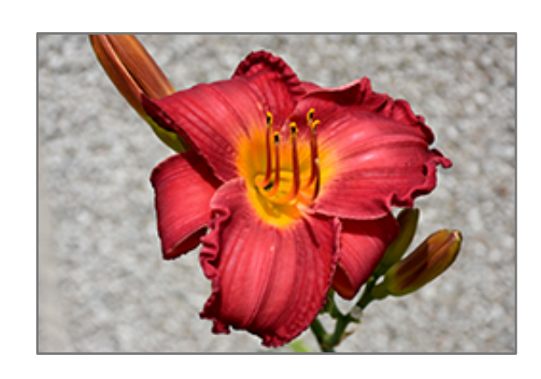
My Ways Daylily flowers

Eye catching crimson-pink trumpets with golden throats; provides a bold contrast to other plants; sturdy, strong, easy to care for, great grassy texture and form; a stunning display when massed in the garden