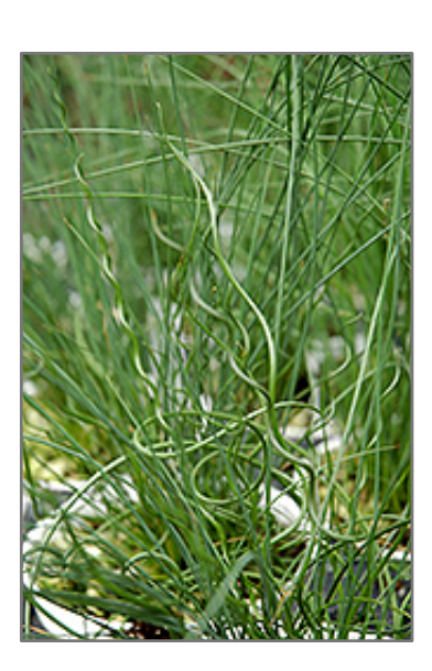
Twisted Dart Rush foliage

Twisted Dart Rush is primarily valued in the garden for its ornamental upright and spreading habit of growth. Its attractive grassy leaves remain dark green in colour throughout the season.