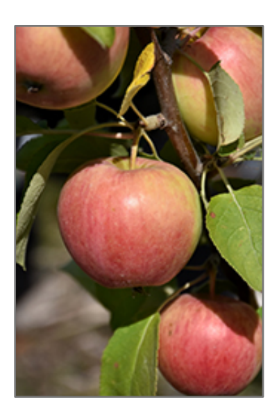
Gemini Apple fruit

This is a deciduous tree with an upright spreading habit of growth. Its average texture blends into the landscape, but can be balanced by one or two finer or coarser trees or shrubs for an effective composition. This is a high maintenance plant that will require regular care and upkeep, and is best pruned in late winter once the threat of extreme cold has passed. Gardeners should be aware of the following characteristic(s) that may warrant special consideration;