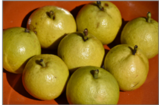
Golden Spice Pear fruit