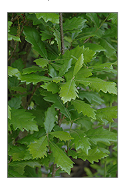
Regal Prince English Oak foliage