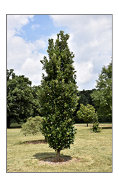
Regal Prince English Oak