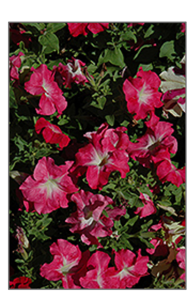
Dreams Coral Morn Petunia flowers

Dreams Coral Morn Petunia is clothed in stunning coral-pink trumpet-shaped flowers with white centers at the ends of the stems from late spring to late summer. Its pointy leaves remain green in colour throughout the season.