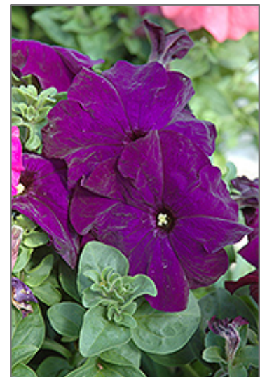
Dreams Midnight Petunia flowers