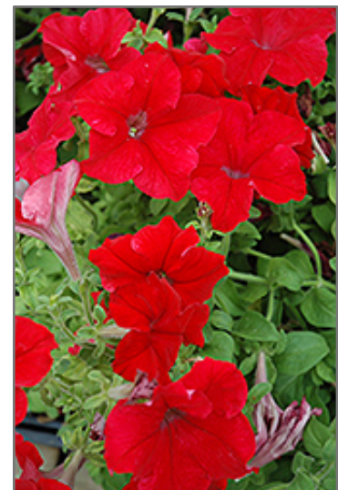
Dreams Red Petunia flowers