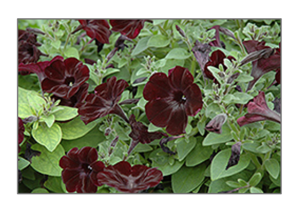
Black Satin Petunia flowers

Black Satin Petunia is clothed in stunning black trumpet-shaped flowers at the ends of the stems from late spring to mid fall. Its pointy leaves remain green in colour throughout the season.