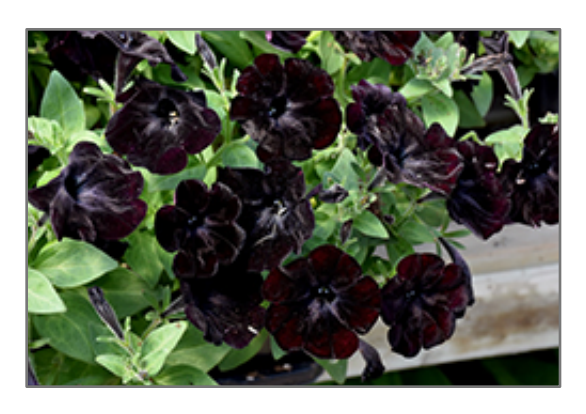
Black Velvet Petunia flowers