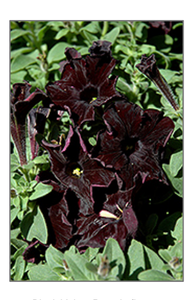
Black Velvet Petunia flowers