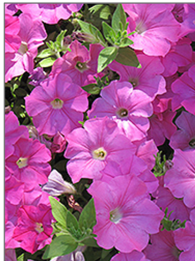
Easy Wave Pink Petunia flowers

Easy Wave Pink Petunia is a dense herbaceous annual with a trailing habit of growth, eventually spilling over the edges of hanging baskets and containers. Its medium texture blends into the garden, but can always be balanced by a couple of finer or coarser plants for an effective composition.