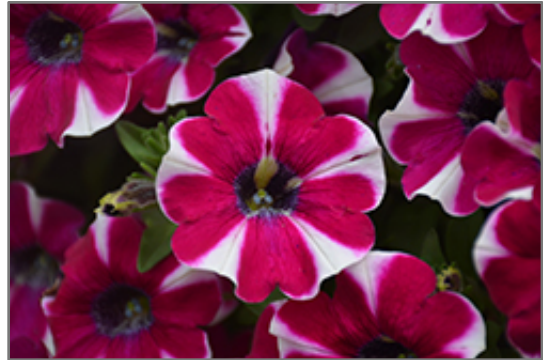
Cascadias Bicolor Cabernet Petunia flowers

Cascadias Bicolor Cabernet Petunia is recommended for the following landscape applications;