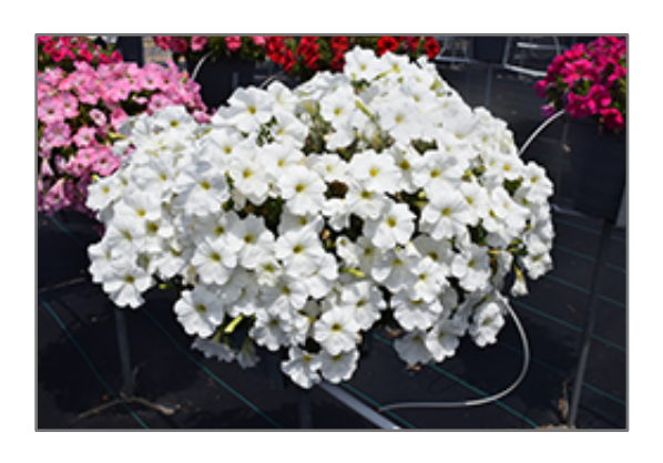
Sanguna White Petunia in bloom

Sanguna White Petunia is recommended for the following landscape applications;