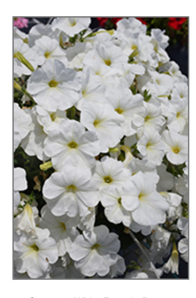
Sanguna White Petunia flowers

This plant will require occasional maintenance and upkeep. Trim off the flower heads after they fade and die to encourage more blooms late into the season. It is a good choice for attracting butterflies and hummingbirds to your yard, but is not particularly attractive to deer who tend to leave it alone in favor of tastier treats. It has no significant negative characteristics.